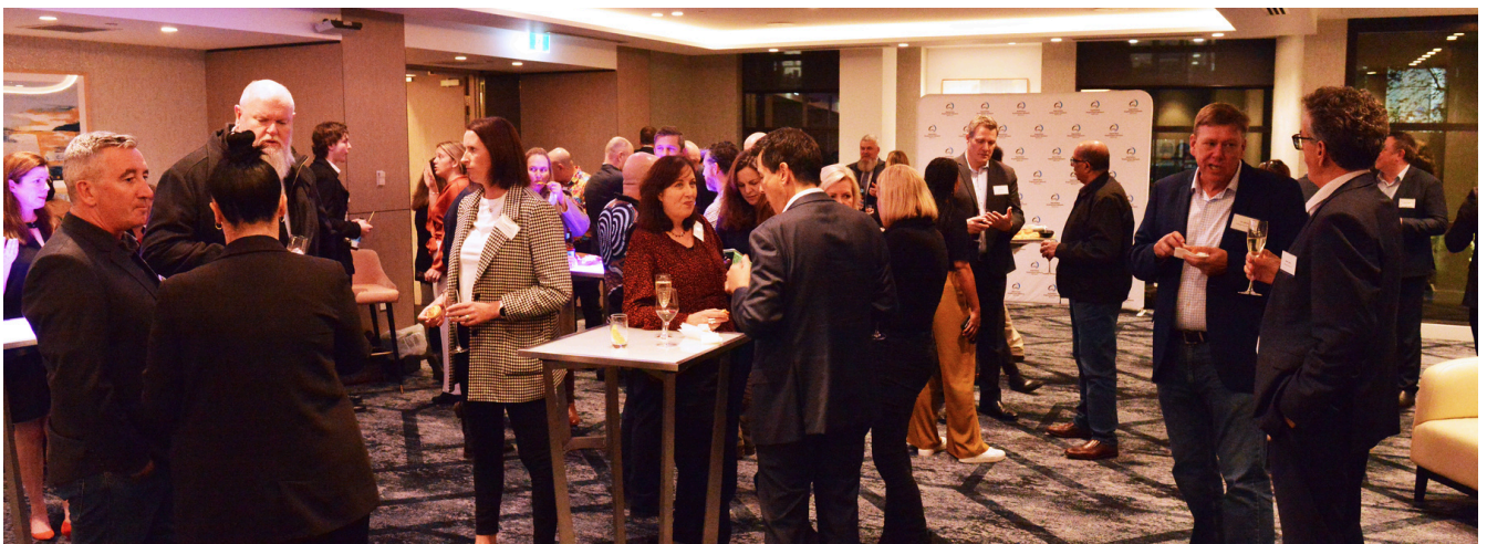
2024 Pre Conference Networking Event - Crowne Plaza Sydney