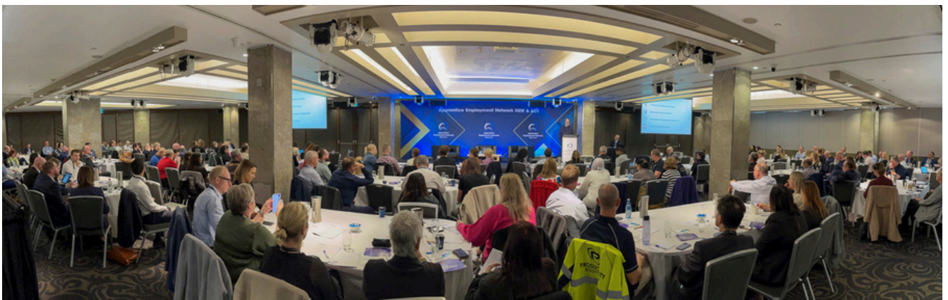
2024 Skills Conference - Dockside Darling Harbour

The 2025 Skills Conference will be held on Tuesday, 24th June 2025 , at a new venue, the Amora Hotel Jamison Sydney . As a lead into the event, a Pre-Conference Networking event will also be held at the Amora Hotel Jamison Sydney on the evening of Monday 23rd June 2025 .